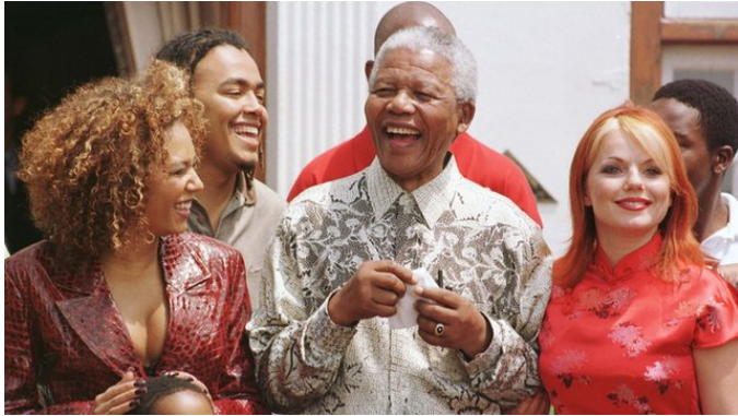
Nelson Mandela with the Spice Girls, Will Smith, Michael Jackson and other stars

"I have had the privilege of spending time with President Mandela and I can say his sense of humour was as great as his optimism."